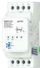
DIN rail mounting